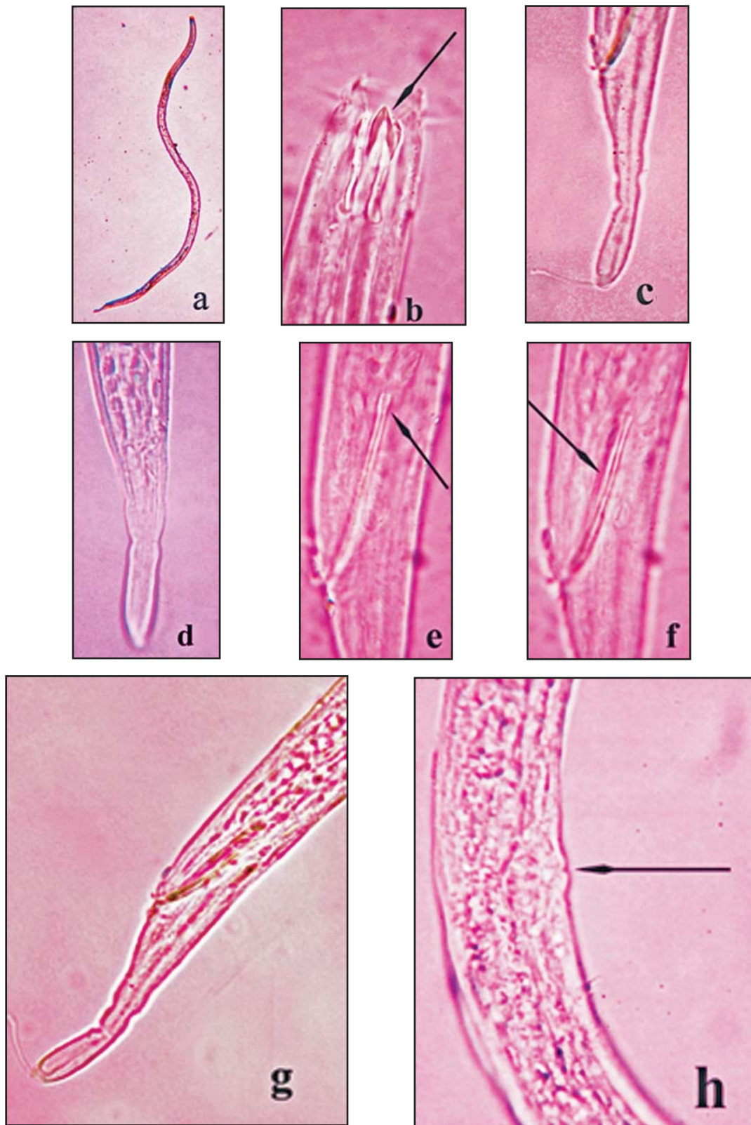
Fig. 2. Different body parts of Oncholaimellus calvadosicus De Man 1890; a. complete stretched specimen (male); b. massive subventral tooth; c. tail end with swollen tip (male); d. tail end of female showing less swollen tip.; e. position of right spicule (separate focusing); f. position of left spicule (separate focusing); g. typical male tail end with focusing two spicules; h. vulva of female