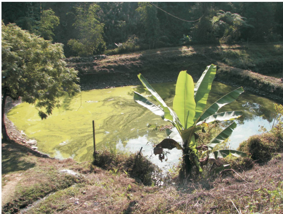
Fig. 1. Habitat of Plumatella javanicus

aquatic weeds, logs, stones, bricks or any other artificial substratum in the ponds, lakes, water reservoirs, streams, and rivers. Annandale (1911) dealt with this group in Indian sub continent. Where as Rao (1962, 1972 and 1976) worked out of fresh water bryozoa in western and middle part of India. At present only 17 species of freshwater bryozoa recorded from India and there is no any record of freshwater bryozoa from Arunachal Pradesh (Samanta, 1998). During a recent survey to Arunachal Pradesh present authors collected 5 colonies of freshwater bryozoa on 06.01.2011.; from a small fishery pond (Fig. 1) at Khonsa (Lat.