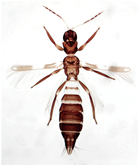
1. Franklinothrips vespiformis (Crawford)