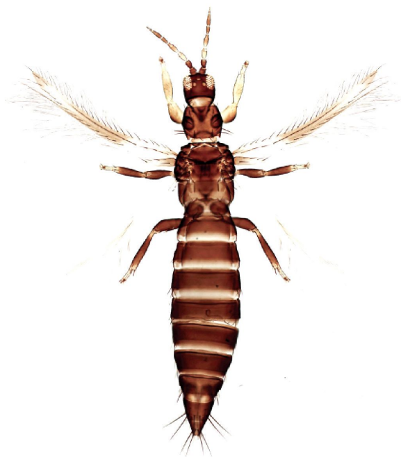
3. Megalurothrips usitatus (Bagnall)