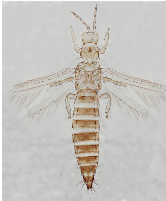
2. Frankliniella schultzei (Trybom)