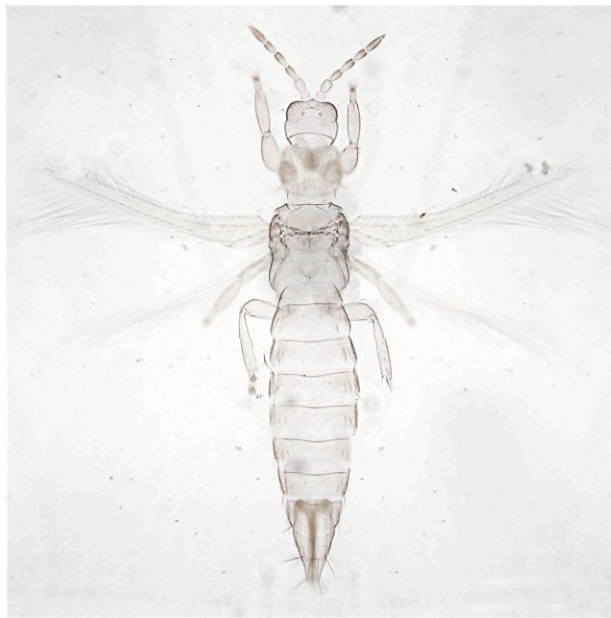
7. Thrips subnudula (Karny)