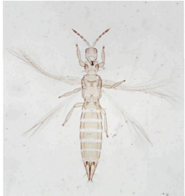
6. Thrips palmi Karny