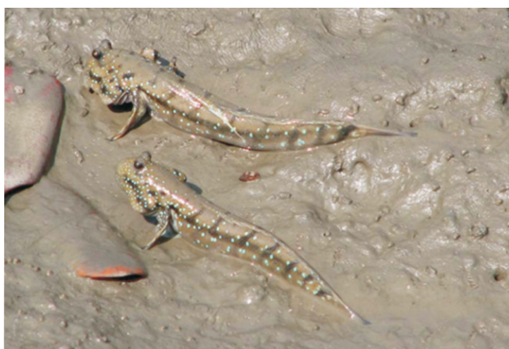
Fig. 3: Most abundant mudskipper, Boleophthalmus boddarti , in Sundarbans