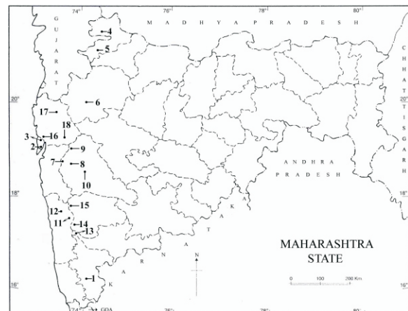
Map 1 : Distribution of Funambulus tristriatus tristriatus (Waterhouse) in Maharashtra State. Records from Maharashtra State includes Kolhapur Dist. : Radhanagari Wildlife Sanctuary [1]; Mumbai Dist. : Ghatkopar [2]; Mumbai Suburban Dist. : SGNP, Borivali [3]; Nandurbar Dist. : Amlibari, Tal. Akkalkua [4], Kondanbari, near Visarwadi [5] (Extended Distribution); Nashik Dist. : Nashik [6]; Pune Dist. : Khandala [7], Karla [8], Bhimashankar [9], Pune [10]; Ratnagiri Dist. : Shirgaum [11], Khed [12]; Sangli Dist. : Chandoli Wildlife Sanctuary [13]; Satara Dist. : Helwak [14], Ghatmatha [15]; Thane Dist. : Thane [16], Jawhar [17], Dehri, Murbad [18].