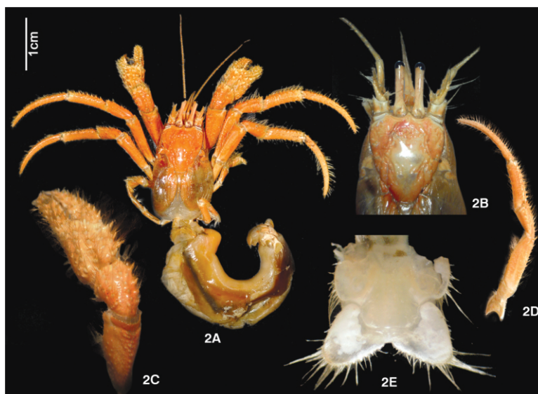
Fig. 2E. Telson