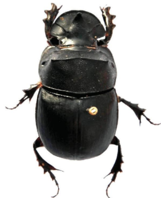
7. Catharsius (Catharsius) sagax (Quenstedt)