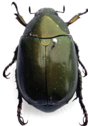
17. Anomala dimidiata (Hope)