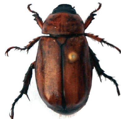
18. Anomala polita Blanchard