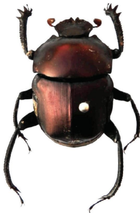
4. Paragymnopleurus sinuatus (Olivier)