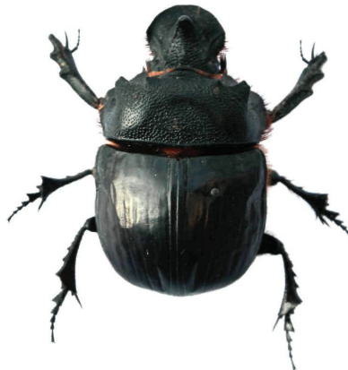
5. Heliocopris bucephalus (Fabricius)