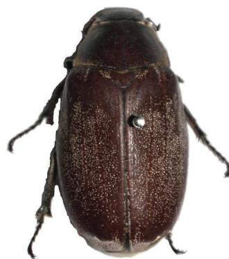
26. Lepidiota albistigma Burmeister