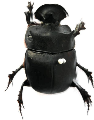
6. Catharsius (Catharsius) molossus (Linnaeus)