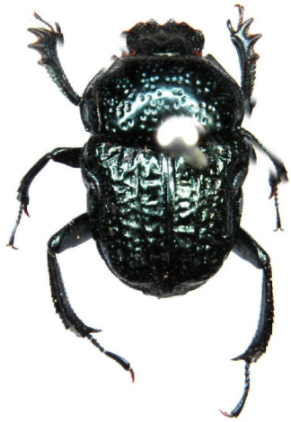
1. Gymnopleurus (Gymnopleurus) cyaneus (Fabricius)