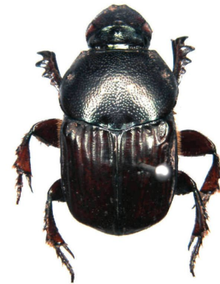
15. Onitis philemon Fabricius