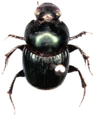
10. Onthophagus (Onthophagus) dama (Fabricius)