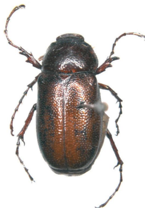
25. Schizonycha ruficollis (Fabricius)