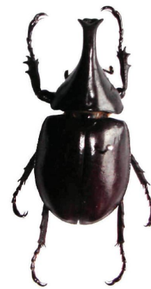
27. Xylotrupes gideon (Linnaeus)