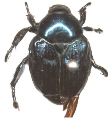
21. Popillia cyanea Hope