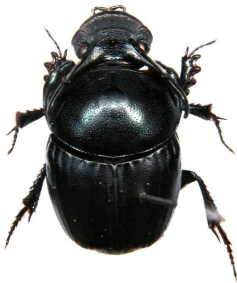
13. Onthophagus (Onthophagus) ramosus (Wiedmann)