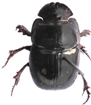
8. Copris (Copris) repertus Walker