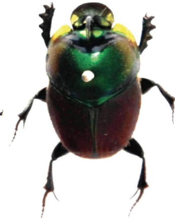
12. Onthophagus (Proagoderus) pactolus (Fabricius)