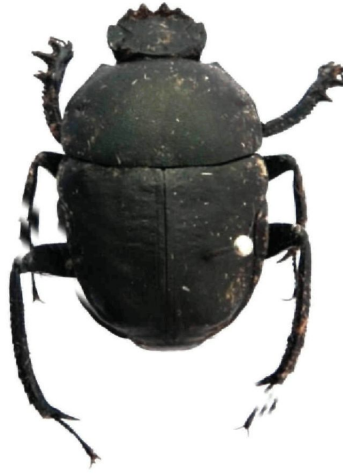
2. Garreta dejeani Castelnau