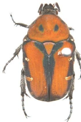
23. Oxycetonia albopunctata (Fabricius)