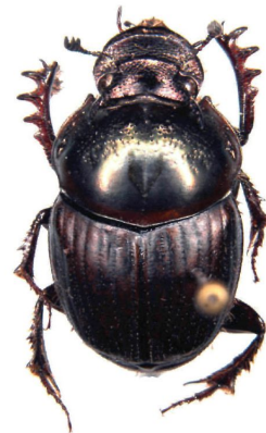
9. Digitonthophagus (Onthophagus) bonasus (Fabricius)