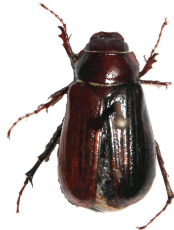
24. Holotrichia longipennis Blanchard