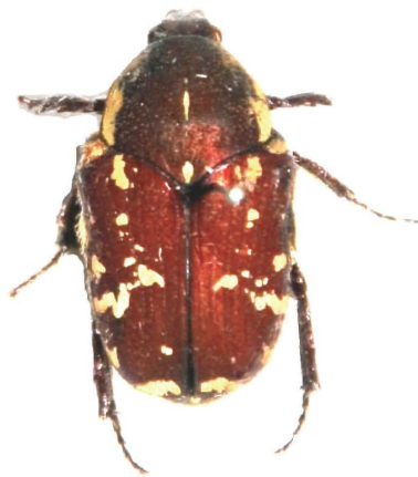
22. Clinteria spilota (Hope)