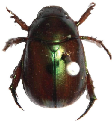
19. Anomala rufiventris Redtenbacher