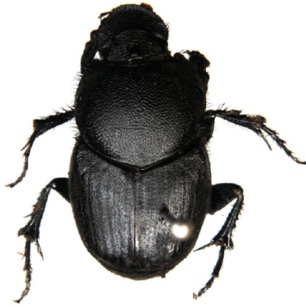
11. Onthophagus (Onthophagus) griseosetosus Arrow