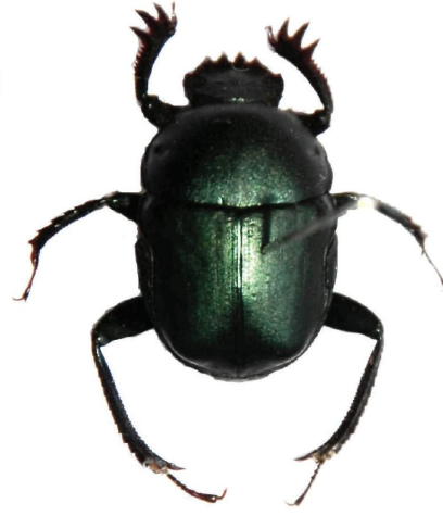
3. Garreta opacus Redtenbacher