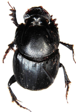
14. Onthophagus (Onthophagus) ramosettus Bates