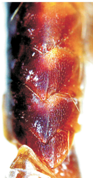
Fig. 3. Carina on sides of 6 th -9 th abdominal segments