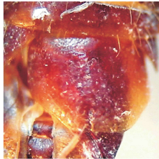
Fig. 5. Penultimate sternite