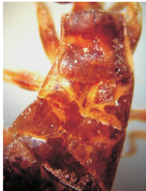
Fig. 6. Pro., Meso. and Metanotum