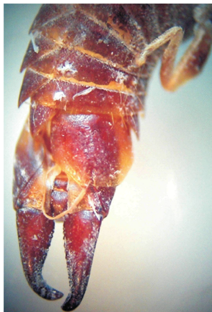
Fig. 7. Abdominal segments 6 th -9 th (Ventral view)