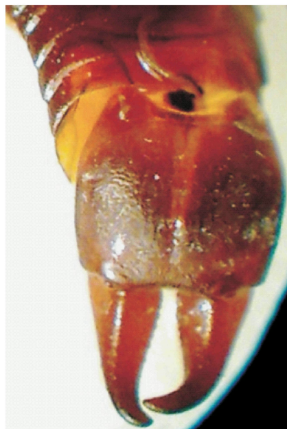
Fig. 8. Ultimate tergite with forceps