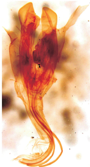
Fig. 2. Male Genitalia