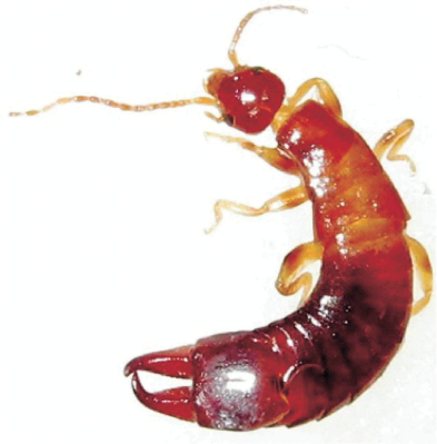
Fig. 1. Euborellia nainitalensis sp. nov. (Dorsal view)