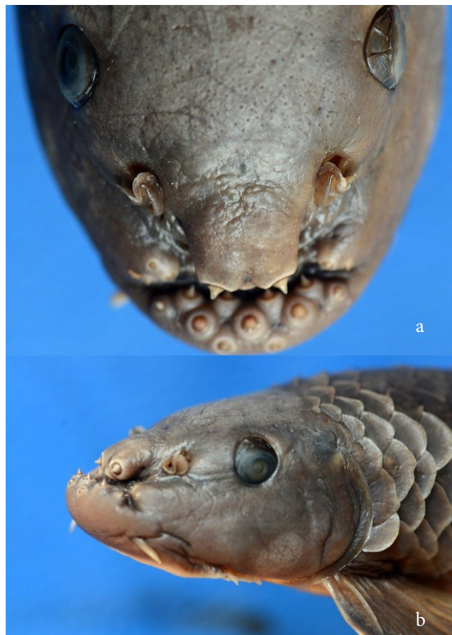
Figure 2. Head of Garra chindwinensis showing proboscis (Holotype, ZSI FF 5906, 120 mm SL). (a). dorsal view; (b). lateral view.

peduncle region. Dorsal profile rising gently overhead, sharply convex up to dorsal-fin origin, then straight up to caudal fin base. Ventral profile flat up to anal fin origin. Head moderately large and depressed, with slightly convex interorbital space; height less than length; width greater than height. Snout moderately pointed with transverse lobe covered with 10–11 small to moderate unicuspid tubercles, demarcated posteriorly by deep transverse groove. Proboscis prominent, quadrate, anteriorly bilobed, forwardly protruding beyond vertically to transverse groove, each lobe with a large forwardly projecting unicuspid acanthoid tubercle on the distal end, one small tubercle present between lobes directing downwards, sharply delineated from depressed rostral surface by deep transverse groove; width smaller than internarial space; and lateral margin with or without tubercle (Figure 2). Depressed rostral surface slightly bulgy. Eye placed dorsolaterally in posterior half of head. Sublachrymal groove shallow not connected to rostral cap groove.