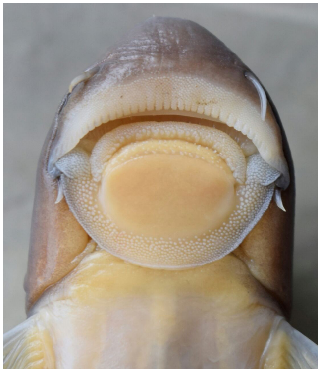
Figure 3. Mental adhesive disc of Garra chindwinensis , (Paratype, PCZM F 1050, 104 mm SL).

beyond midway to anal fin origin, surpassing anus when adpressed; second branched ray longest; inserted below base of second branched dorsal fin ray; distal margin almost truncate. Anal fin short with 2(2) simple rays and 5(2) branched rays, first branched ray longest, not reaching caudal fin base; distal posterior margin slightly concave; origin closer to caudal fin base than to pelvic fin origin. Anus closer to anal fin origin than to pelvic fin origin. Caudal fin forked; lobe tips pointed; lower lobe slightly longer; tenth principal ray shortest.