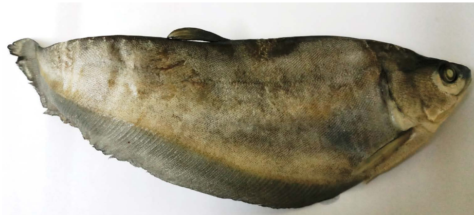
Notopterus notopterus (Pallas, 1769).