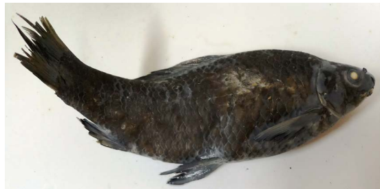
Labeo calbasu (Hamilton, 1822)