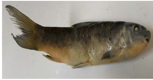
Labeo boggut (Sykes, 1839)