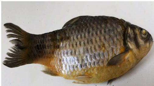
Systemus sarana (Hamilton, 1822)