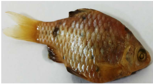
Pethia ticto (Hamilton, 1822)