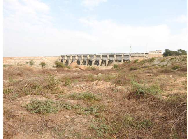
Figure 2. A view of area of study downstream to Dantiwada dam.