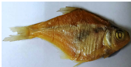
Osteobrama cotio (Hamilton, 1822)