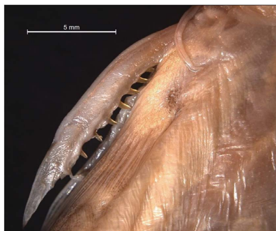
Figure 3. Ventral surface of pectoral fin spine of Glyptothorax distichus , ZSI FF 5391, paratype, 78.0 mm SL.

Dorsal fin located halfway between snout tip and adipose-fin origin, with I, 6 rays. Dorsal fin spine strong, gently curved, serrated posteriorly, shorter than depth of body immediately ventral. Adipose-fin short, anterior margin straight, posterior margin convex. Pectoral fin slightly shorter than head, with I, 9, i rays. Pectoral fin spine broad, anterior margin smooth, posterior margin with 10–12 serrae without furrow at approximate juncture of anterior and posterior portions of each fin-spine element (Figure 3). Pelvic fin with I, 5 rays, not reaching the origin of anal fin when adpressed. Ventral surface of paired-fins not pleated. Anal fin long, with II, 8, i rays, originating at vertical slightly posterior to adipose-fin origin. Caudal fin forked, with 17 or 15 rays.