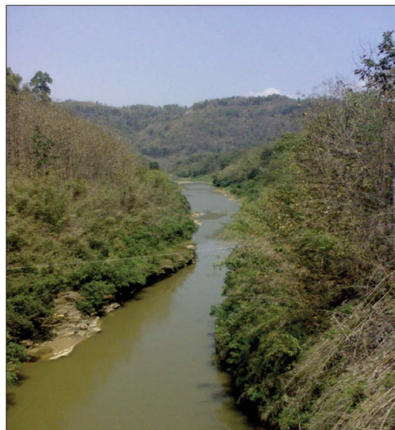
Figure 4. Tlawng River at Sairang, Mizoram, type locality of Glyptothorax distichus .

Distribution: Presently known only from the type locality, the Tlawng River near Sairang, Aizawl District, Mizoram (Barak-Meghna-Surma drainage), India (Figure 4).