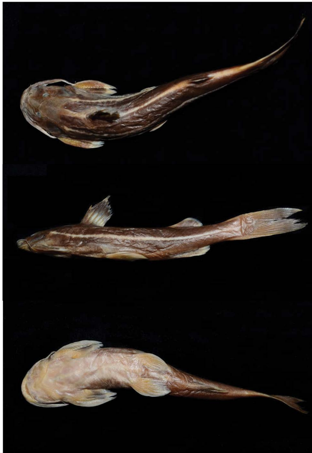
Figure 1. Glyptothorax distichus , ZSI FF 5390, holotype, 101.1 mm SL; India: Mizoram: Tlawng River; dorsal, lateral and ventral views.

Material examined: Holotype: ZSI FF 5390, 101.1 mm SL; India: Mizoram: Aizawl district: Tlawng River near Sairang (Barak-Meghna-Surma drainage), 23°48'26" N 92°38'45" E; Coll. L. Kosygin, 24-ix-2007. Paratypes: ZSI FF 5391, 1, 78.0 mm SL; same data as holotype.