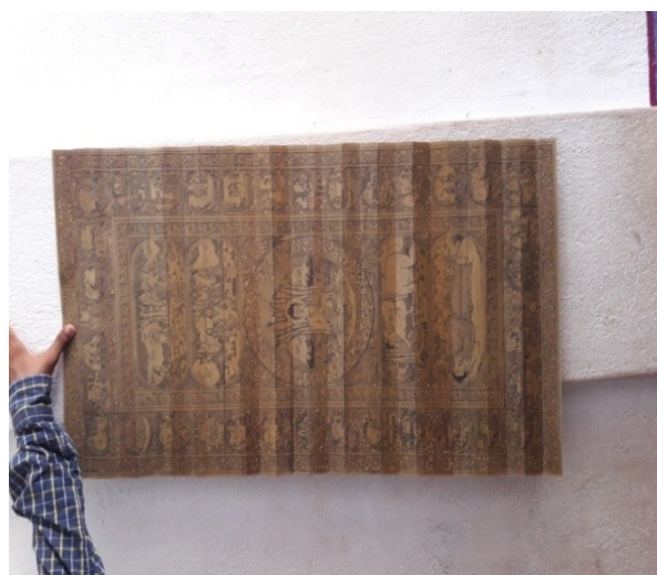
(Plam leaf painting works)