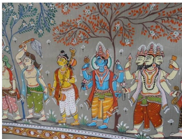
(Wood and Tassar Painting work displayed)