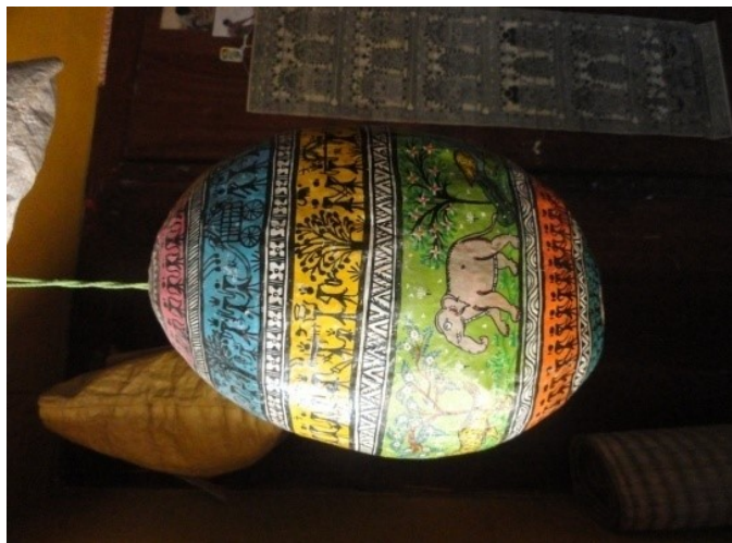
(Paper mask and coconut painting is displayed)