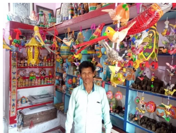
(Artisans are selling the artwork in their house)