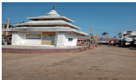
(The entry gate and village of the village)

The houses of the village are situated in both of the sides from entry to end. In the middle part of the village many temples are increasing the attraction of the visitors. These temples are Bhagabat Tangi, Radhamohan, Gopinath Raghunath, Laxminarayan, Gouranga and the Bhuasani. The village comprised of around one hundred fifty families having many castes. There are many educational institution like Anganwadi Kendra, Primary school, high school are found in the village.