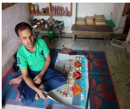
(Artisans work their workshop)

The experienced chitrakaras do not use the pencil to make the sketches, but the young painters first draw the sketches with the help of pencil. First stage is (Dhadimara) demarcation of the borders, with the help of scale, in past string is used to make lines in the border. The second stage is Tipana or sketching, which starts with head, then torso and legs are added, the next stage is Hingula or red background is most commonly used in pattachitra paintings.