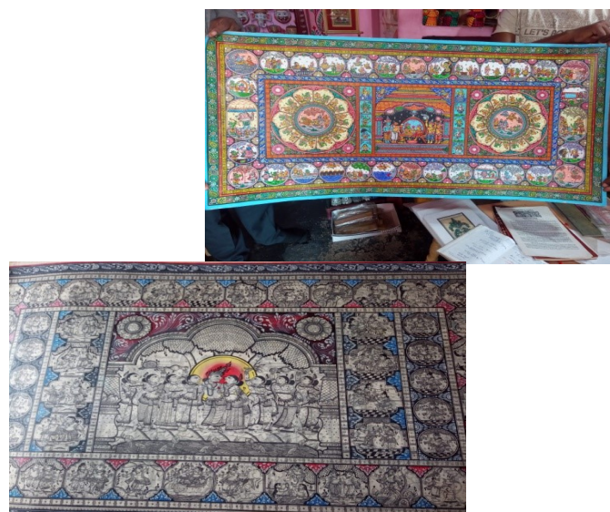
(Patachitra painting works)