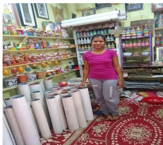
(Glass painting work is displayed)