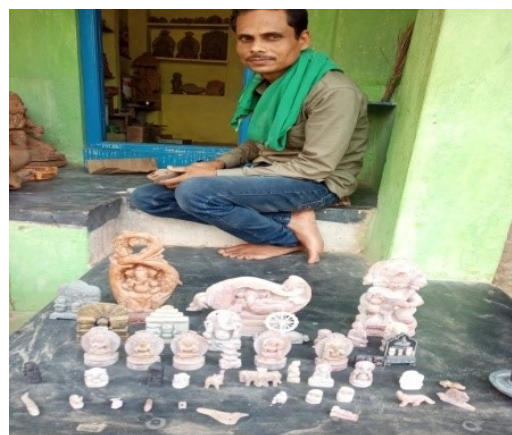
(An Artisan is involved with the stonework)