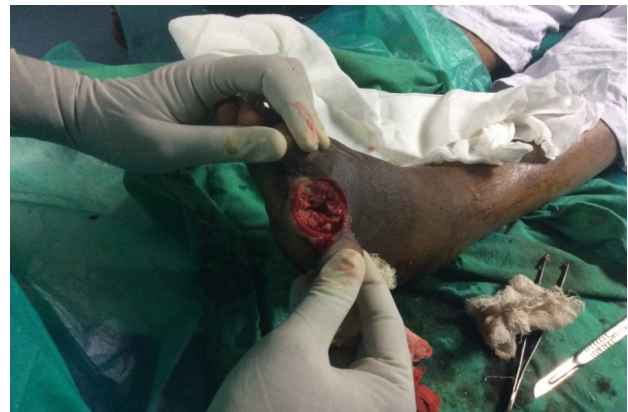
Wound after 6th week