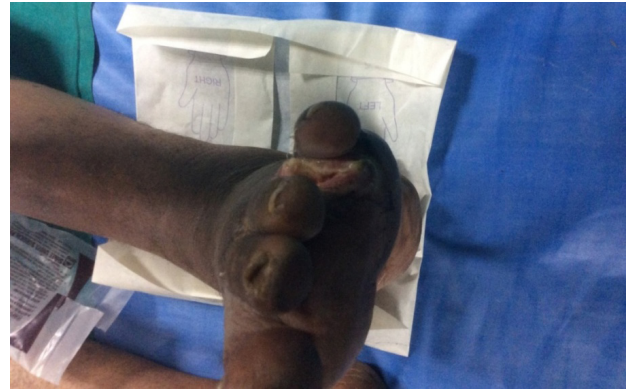
Wound on day 1