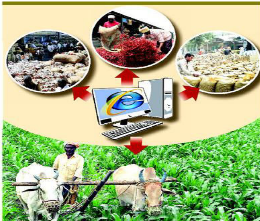
Figure 1: Farm trade gets a new direction with e-mandi

National Commodity and Derivatives Exchange Limited (NCDEX) Spot Exchange has completed implementation of electronic-tendering in 13 agricultural produce marketing committees (APMCs) in Karnataka and is planning to soon extend it to another eight states."At present, we have completed modernization of 13 APMCs in Karnataka by introducing e-auction system that is helping farmers getting optimum price in a transparent way.