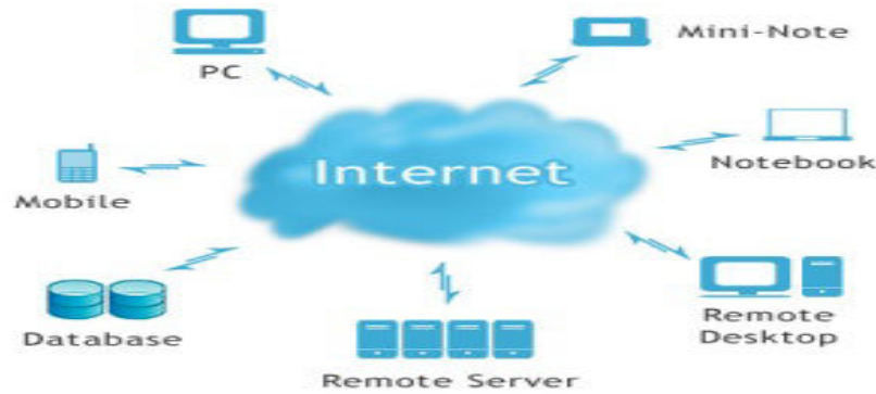
Figure 1: Overall Architecture of Cloud