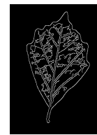
(c) Shape and venation feature