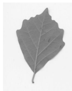
(b) Gray level