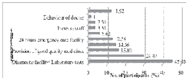
Figure-III: Suggestions given by study subjects to improve the quality of health care services at ESI dispensary