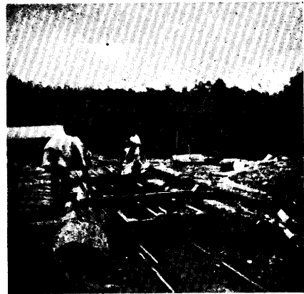
PLATE No. 4. A pair of timber trucks ready for loading.