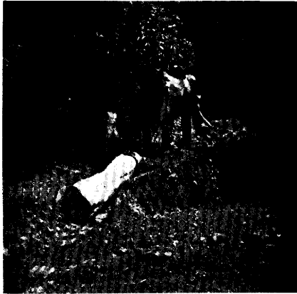
PLATE No. 1. An elephant dragging a log in the extraction area.