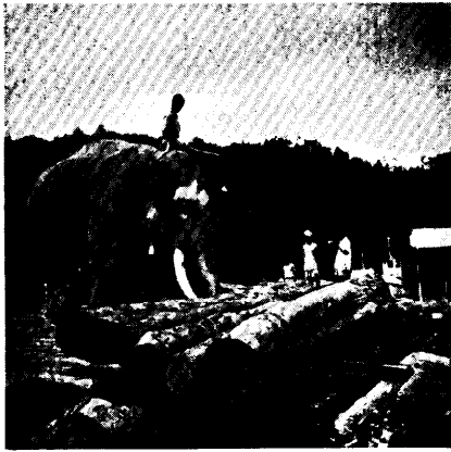
PLATE No. 5. An elephant loading timber trucks at the loading deck.