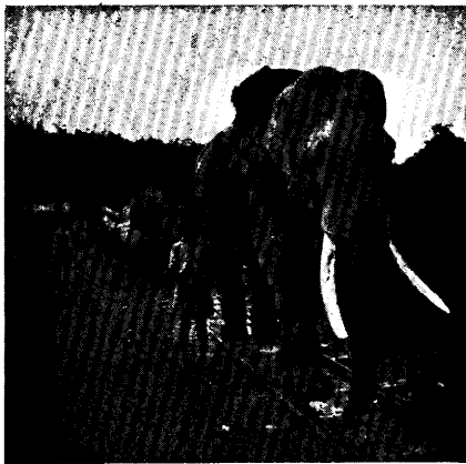
PLATE No. 6. An elephant hauling a log-loaded train.