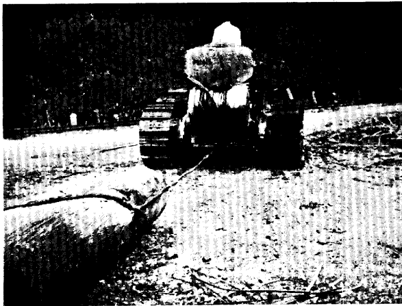
PLATE No. 2. A D6 Caterpillar tractor dragging logs.