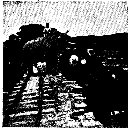
PLATE No. 8. Elephant unloading timber trucks at the unloading deck.