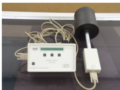
Figure 3. Ionization chamber and electrometer.

For data processing, we conducted Komogorov-Smimov goodness-of-fit test and indicated the average of descriptive statistics quantity after confirming normal distribution. For significance test, One-way ANOVA test was used. The significance level of all the statistics was 5%. Also, to examine the reduction rate of exposure dose with the use of filters, we set 100% before its use and tried to get percentages according to the thickness 23-30 .