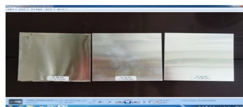
Figure 2. Schematic of added Al filter.