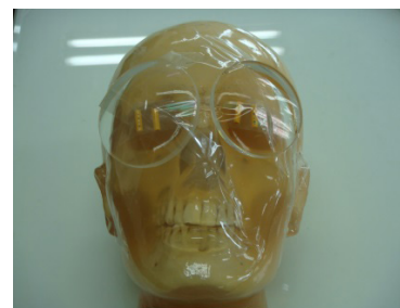
Figure 1. Glass fluorescent device's dose measurement location.

The added filtration was made of aluminum with 99.9% of purity, with width 10 cm, length 10 cm and thickness 0.6 mm, 0.8 mm, and 1.0 mm [Figure 2].