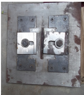
Figure 1. Fixture.

The process parameters are rotational speed of tool, feed rate of tool and pin profile of tool 12 . The Taguchi L9 orthogonal array method was used for the different optimization with different inputs. The working parameters as shown in Table 1 implemented in this study are taken after different trials. The three levels are taken for each process parameter. Vickers micro hardness tests were completed on cross area opposite to the weld line, at mid thickness over the weld zone utilizing 100 gf load 13 .