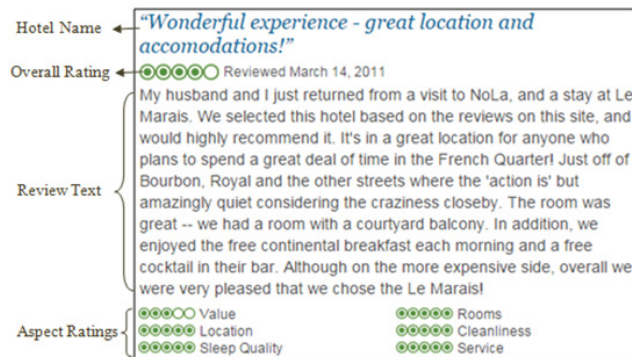
Figure 1. A Sample Hotel Review.

studies such as 5-9 . Other studies such as 10-12 considered a different aspect of sentiment classification that is rating a review by assigning it a degree from 1 star to 5 stars as shown in many merchant websites such as amazon.com , tripadvisor.com . There are also other interesting and important problems: mining comparative opinions, opinion spam detection, and opinion lexicon generation.