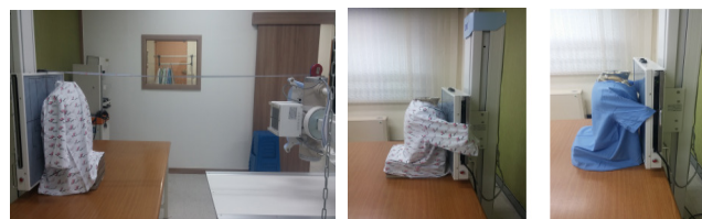
Figure 1. Acquisition of Phantom Image.

The dose was fixed at 4mAs for the shooting. Also, the tube voltage was varied to 100kVp, 105kVp, 110kVp, 115kVp and 120kVp. The tube voltage was fixed at 100kVp and varied to 2mAs, 3.2mAs, 4mAs, 5mAs and 6.3mAs for the shooting. The object distance (source-to-image-receptor distance; SID) was set at 180cm.