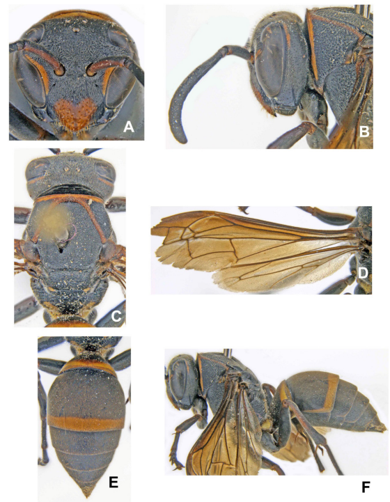
Fig. 2. Polistes dawnae A. Head in frontal view; B. Head and pronotum in lateral view; C. Head and mesosoma in dorsal view; D. Wings; E. Metasoma in dorsal view; F. Body in lateral view.

Mesosoma (Fig. 2C): Pronotum reticulate dorsally, forming thin lamella in dorsal part, slightly sinuate on lateral region, reaching ventral corner of pronotum. Yellow stripe along pronotal carina and posterior margin present. Mesoscutum black with fine punctures, weakly convex. Scutellum with deep scattered punctures and a raised carina in the middle at base running half way towards the apex, metanotum with punctures and paired yellow spots on the antero-lateral region, propodeum with distinct striae and with paired longitudinal yellow spots.