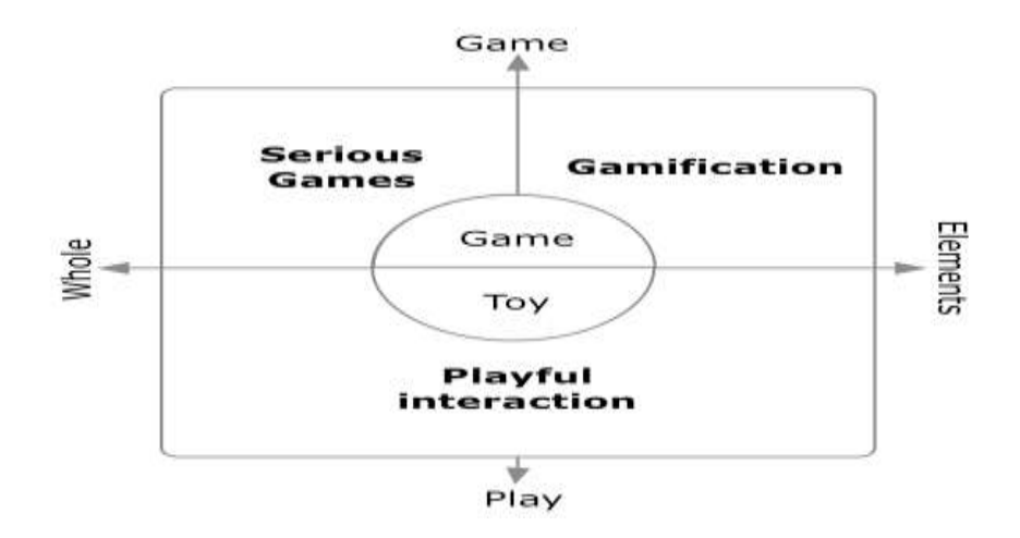
Fig. 1 Positioning Gamification

To establish gamification as an independent construct vis-a-vis other related constructs, we must look at the following representation (Deterding, 2011).