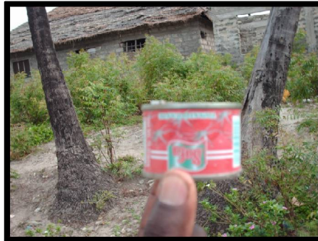
Figure 3: A Small, Empty Tomato Sauce Tin Kikebe Used In the Curing Of Eye Infection in Donkeys in the Four Villages

The treatment of eye infections in donkeys was done by heating a small, empty tomato sauce tin ( kikebe ) and putting the smoking tin on the affected eye (Figure 3 below). It was believed that the smoke and other gasses that were emitted during heating of the tin helped to cure the infection. It was, therefore, common to see donkeys with dark circular marks around the eyes as vestiges of this activity. When there was lachrymation from any or all of the eyes, a cloth was put in hot water and the hot cloth pressed on the affected eye(s). It was believed that this process cured the donkey from the condition.