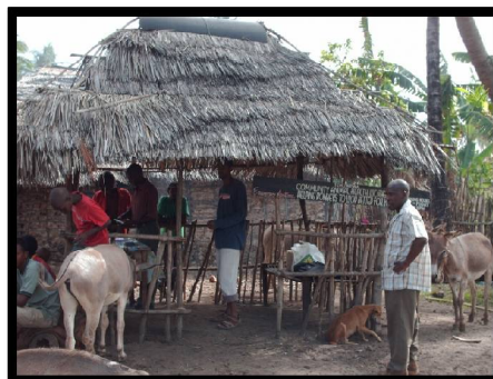
Figure 2: A Donkey Sanctuary Installation in Tchundwa Village Where Donkeys Were Taken By Inhabitants for Treatment Whenever Cases Arose

There appeared to be no ethno-medical practices that targeted trypanosomiasis but wounds were treated through use of crushed old battery cells and the resultant carbon powder mixed with either simsim or coconut oil and then applied on the wounds. According to respondents, the mixture worked faster than manufactured drugs. They (respondents) indicated that the wounds took about three days post application to dry up when this mixture was applied. Cases of tetanus ( Ugonjwa wa kupindana ) were treated by placing a hot metallic bar on the affected part of the concerned animal. This was viewed by most respondents to be the only remedy available for this kind of condition (tetanus).