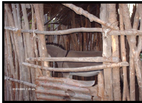
Figure 4: Donkey Structure at Tchundwa Village

As far as housing was concerned, in all the four villages, some villagers constructed structures in which to house their donkeys and domestic animals (Plates 3 & 4 below). This may be a demonstration of their love for their donkeys although at night many donkeys could also be heard roaming in the village. However, a key informant observed that some donkey keepers mistreated their donkeys through over loading, over beating, over riding and poor watering practices.