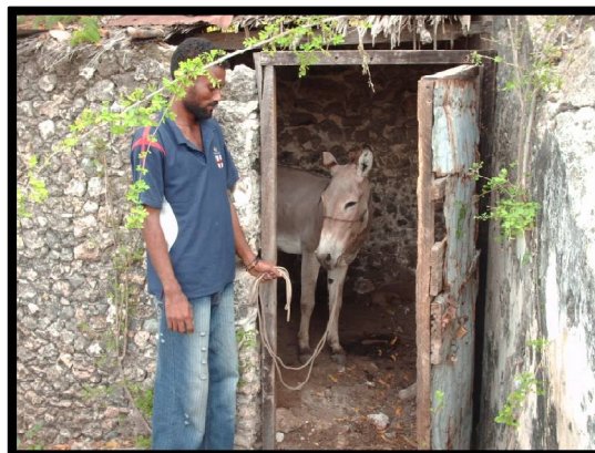
Figure 5: Donkey Structure at Faza Village