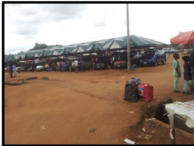
Figure 1: Showing the Loading Bay and Parked Vehicles in the Terminal