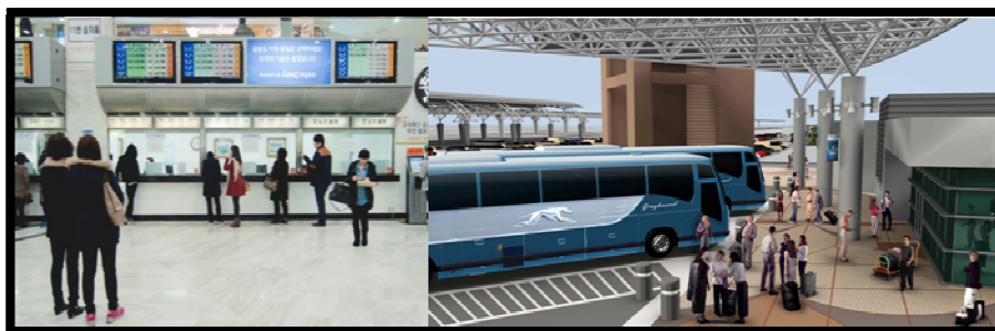
Figure 5: Showing the Ticketing Booth, Loading, and Offloading Bay