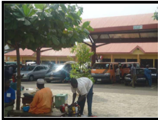
Figure 2: Showing the General Bus Park in the Garage with an Arrival Concourse