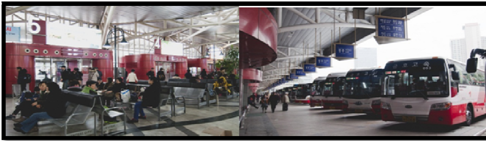
Figure 4: Showing the Waiting Area, Loading, and Offloading Bay