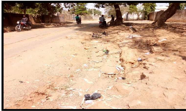
Figure 6: A Typical Case of Erosion Due to Poor Drainage Network in GRA