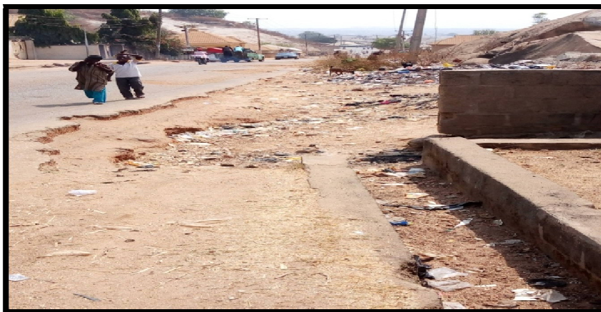
Figure 4: A Discontinued Drainage Close To CRDP – Nasarawa Road, Iya Ward

Other issues pointed out by the respondents in the various wards regarding the quality of drainages were the fracturing (that is the non-continuity or connectivity) of drainages and the covering of drainages by waste/sand. Surprisingly, GRA which is purported to be a high brow area have very high responses in favour of the drainages within this as table 4.4 shows that 12.5% and 22.5% of the respondents in GRA were of the opinion that drainages in the area are highly fractured and often covered with wastes/sand respectively. In Keffi East Central, the opinion was upheld by 27.5% and 12.5% of the respondents respectively, followed by 22.5% and 23.75% in Keffi North Central. It was 22.5% and 10% in TudunKofa, while the claim was less supported in Yara ward. This could be due to the presence Emir Palace in the zone which made it to have been given more developmental attention.