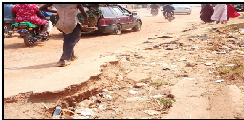
Figure 7: A Typical Case of Structural Failure of Road along Old Nasarawa Road

Furthermore, 58.75% of the respondents said that poor drainage networks results in outbreak of malaria and other diseases due to increased volume of stagnating water in the neighbourhoods. Also, 47.25% of the respondents claimed that inadequate drainage causes flooding of markets/shops. In this instance, people are endangered as they step into their flooded shops to take care of what could still be recovered. Pollution water sources, particularly hand dug wells due to flooding, and collapsing of walls/buildings were also identified by 39% and 10% of the respondents respectively, as some of the environmental effects of poor drainage network in Keffi.