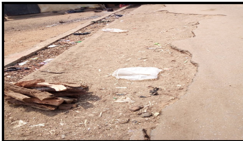
Figure 2: A Typical Keffi drainage around FMC, Keffi East Central

This finding corroborates the statement of David (2014) that; urban flooding which is the inundation of land or property in a built environment, particularly in more crowded areas are caused by rainfall overwhelming the capacity of drainage systems. According to Offiong et al., (2009), urban environments in Nigeria are faced with myriad of issues regarding poor drainage systems. This is in addition to the problem of water tight structures which are the major causes of storm water destruction (Belete, 2011).