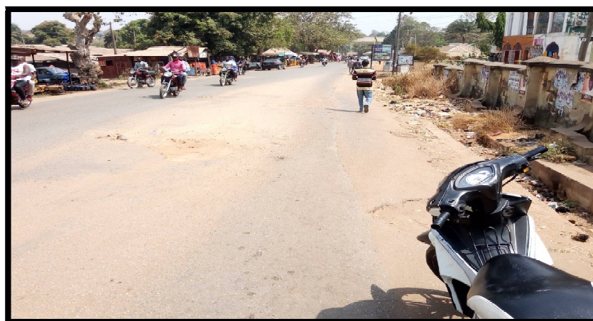
Figure 5: Waste/Sand Filled Drainage Immediately After Antaubridge, Keffi North Central