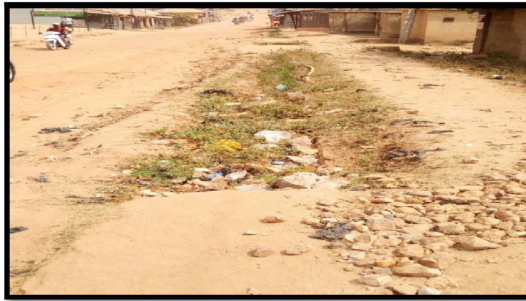
Figure 3: Poorly Plastered Drainage at Dadin Kowa, Yara Ward

Other issues pointed out by the respondents in the various wards regarding the quality of drainages were the fracturing (that is the non-continuity or connectivity) of drainages and the covering of drainages by waste/sand. Surprisingly, GRA which is purported to be a high brow area have very high responses in favour of the drainages within this as table 4.4 shows that 12.5% and 22.5% of the respondents in GRA were of the opinion that drainages in the area are highly fractured and often covered with wastes/sand respectively. In Keffi East Central, the opinion was upheld by 27.5% and 12.5% of the respondents respectively, followed by 22.5% and 23.75% in Keffi North Central. It was 22.5% and 10% in TudunKofa, while the claim was less supported in Yara ward. This could be due to the presence Emir Palace in the zone which made it to have been given more developmental attention.